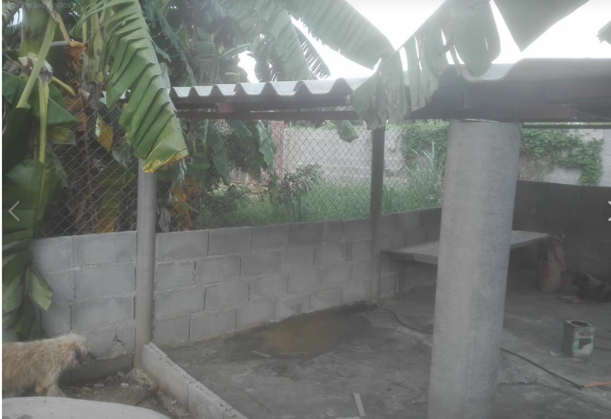
Figure 2. Mohk's shelter (also called Mom's shelter).

In 2018 we have worked on our goal to sterilize a number of dogs to prevent growth in numbers in the shelter. Also a dog from the Nonthaburi location was sterilized. We could however not prevent a few dogs from getting pregnant because of the large number of females to be separated out and some males jumping over a high wall. The numbers of pups was far less than last year.