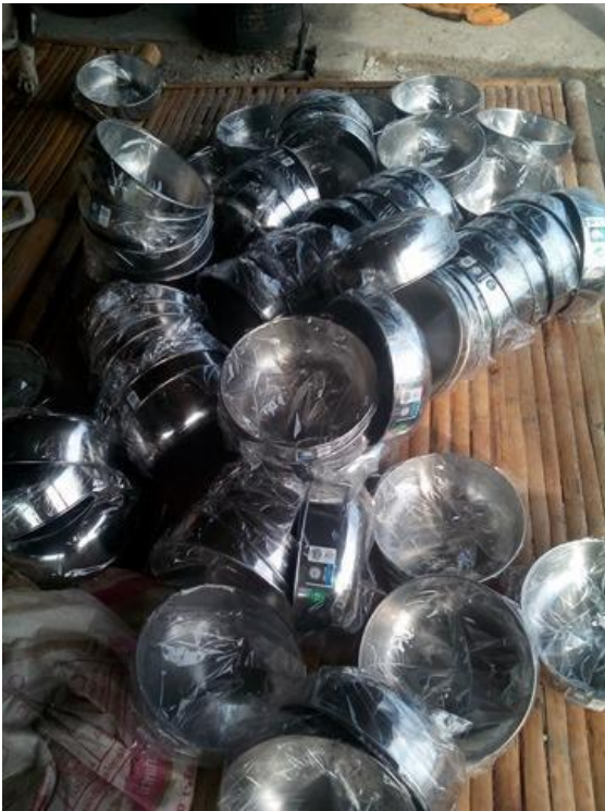
Figure 3. New metal food bowls