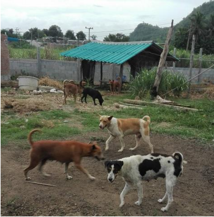
Figure 2. Panda's shelter in the background and Panda in the foreground